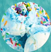
#70125 BIRTHDAY CAKE