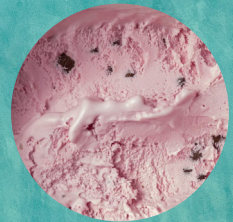
#78085 RASPBERRY TRUFFLE