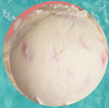
#78053 PEPPERMINT STICK