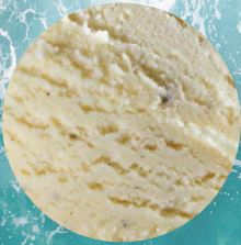
#70202 BANQUET VANILLA