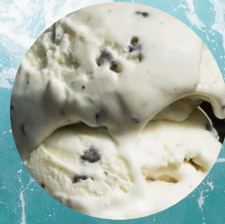
#78051 MINT CHOCOLATE CHIP