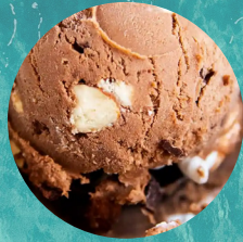
#78054 ROCKY ROAD