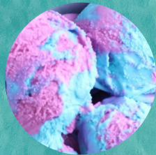
#78063 COTTON CANDY