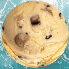
#78049 CHOCOLATE CHIP COOKIE DOUGH