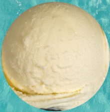
#74521 FRENCH VANILLA