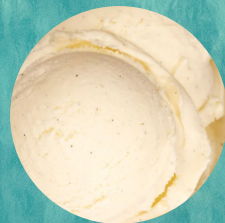
#78888 VANILLA BEAN