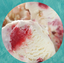
#78130 STRAWBERRY CHEESECAKE