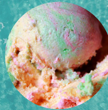
#78036 RAINBOW SHERBET