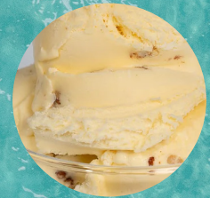
#78048 BUTTER PECAN