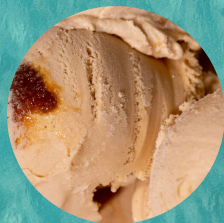
#78162 CARAMEL COMBUSTION