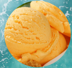
#74336 SHERBET ORANGE