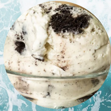
#78050 COOKIES AND CREAM