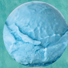
#78083 BLUE MOON